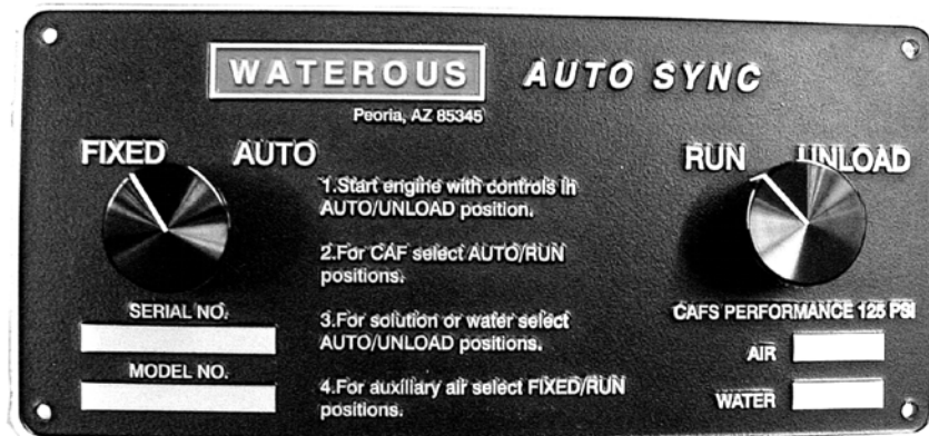
Figure 1 Manual Auto-sync Controls

NOTE: Monitor compressor instruments during any and all operations.